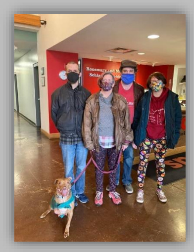
Good Luck Phoenix!