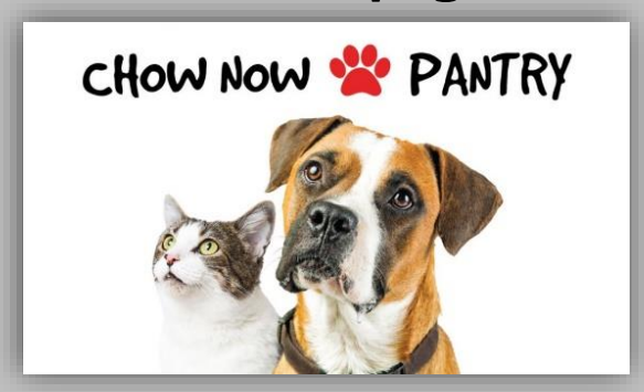
All things SPCA Cincinnati can be found on our website. Encourage everyone to visit TODAY!